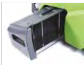
FRONTAL WASTE TRAY