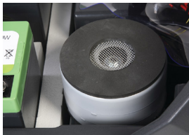
THREE STAGE MOTOR