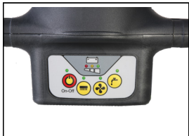
PRESET WORKING PROGRAMS