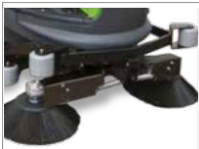
PRE-SWEEP SYSTEM ON CYLINDRICAL MODEL