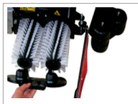
COMBINED SCRUBBING-SWEEPING SYSTEM THAT INCLUDES DEBRIS HOPPER