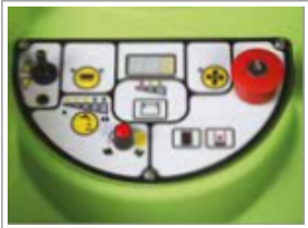
INTUITIVE CONTROL PANEL

10/13 gal 20" brush drive and traction drive