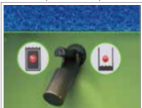
ANTI-FOAM SYSTEM WITH SPECIAL ELECTROMECHANICAL SUCTION MOTOR PROTECTION