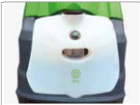
SEPARATE DETERGENT DOSING SYSTEM (OPTIONAL)