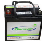
12 V 84 AGM 12V84-AGM