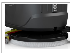
SPIN-ON, SPIN-OFF BRUSH