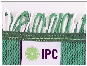
HI-TECH COLOR BLENDING