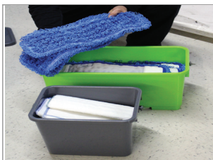
IDEAL FOR PRE-TREAT SYSTEM