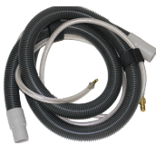
TOOL & HOSE ACCESSORY BAG (SC7 & SC12) FX1049AC