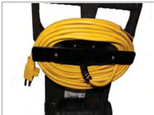
BUILT IN CORD STORAGE