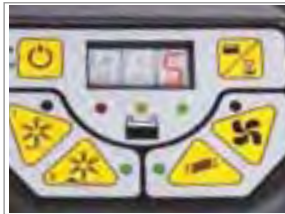
INTUITIVE CONTROL PANEL