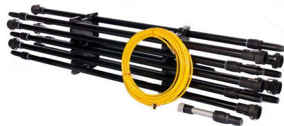
FLIP LOCK SECTIONAL POLES