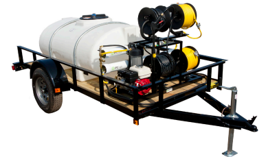
HYDRO STATION W/ TRAILER