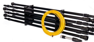
5' Sectional Kit