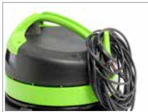
INTEGRATED CORD WRAP