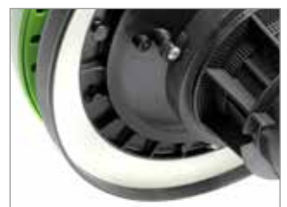
INNOVATIVE HEAD GASKET