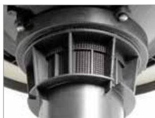
INTEGRATED ANTI-FOAM SYSTEM