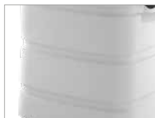
ULTRA-SHOCKPROOF PLASTIC TANK