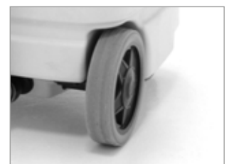
LARGE WHEELS WITH TYRES