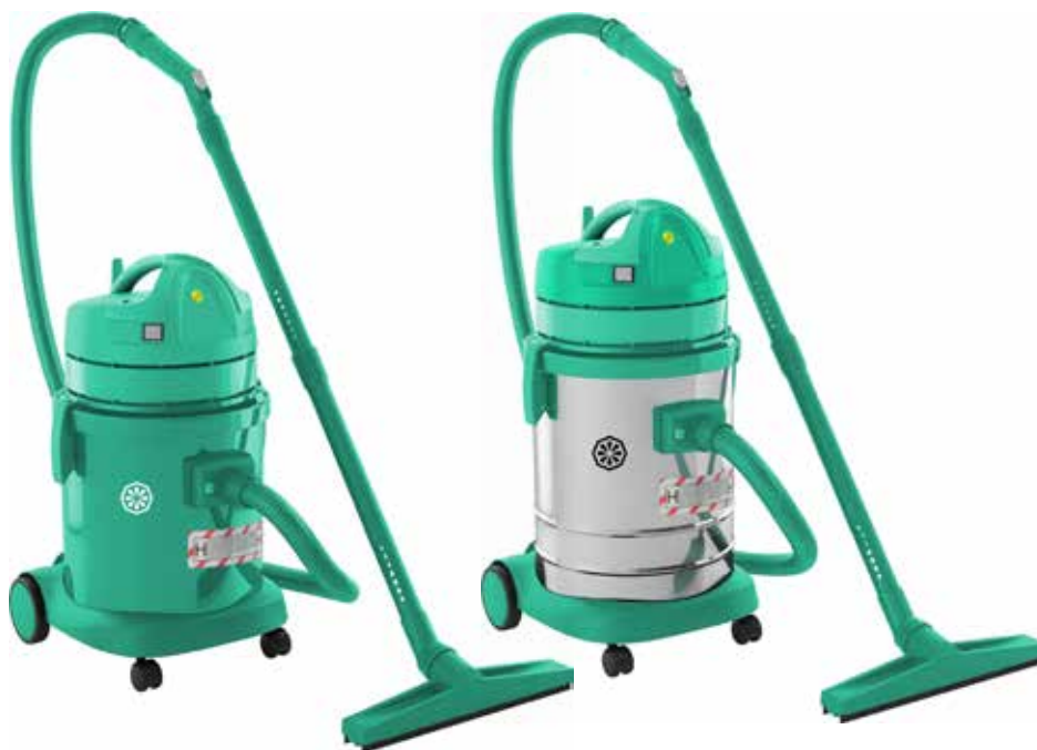
GP 1/27 HEPA ISO5