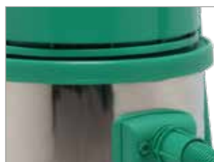
ANTIBACTERIAL PLASTIC AND STAINLESS STEEL AISI 304