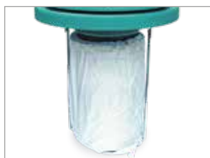
HEPA H14 CARTRIDGE WITH POLYCARBON PREFILTER