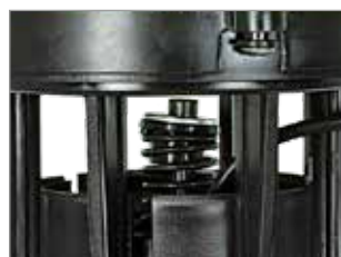
ELECTRICAL FILTER SHAKER