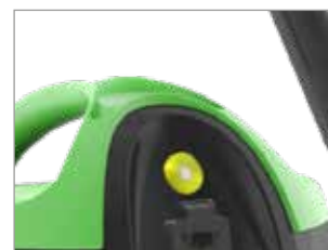
WARNING LIGHT FOR SPEED CONTROL > 20 M/S