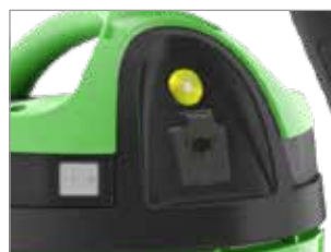
ADDITIONAL SOCKET FOR POWER TOOL WITH AUTOMATIC START/STOP