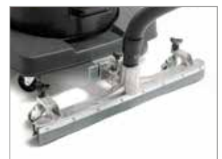
OPTIONAL FIXED ACCESSORY