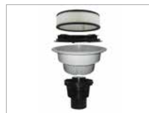
SYSTEM DFS FOR SIMULTANEOUS DRY AND WET PICK UP