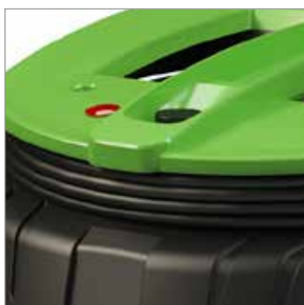
Bag full indicator